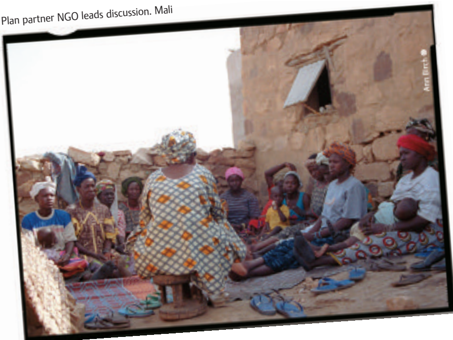
Plan partner NGO leads discussion. Mali

Skills and knowledge are important attributes, but in this very personal issue, commitment and motivation are just as important. The field workers who are promoting the abandonment of excision are under the close scrutiny of the population. Yet, many of them continue to have their daughters excised. They are subject to the same social pressure as everybody else. But if they fail as role models to resist this pressure, they will not be effective in bringing about the desired behaviour change in the villages where they work.