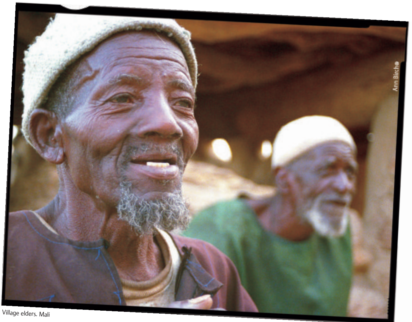
Village elders. Mali

“After the excision, the eyes turn red because it is so painful. That pain is of educative value: it changes the behaviour of the girl. That’s why, in the forest, the girls get ritually beaten with canes or branches and they are more docile afterwards. If the girl behaves badly after having been to the forest, you just tell her to remember the night of initiation and she obeys.” (Woman in a village in Guinea)