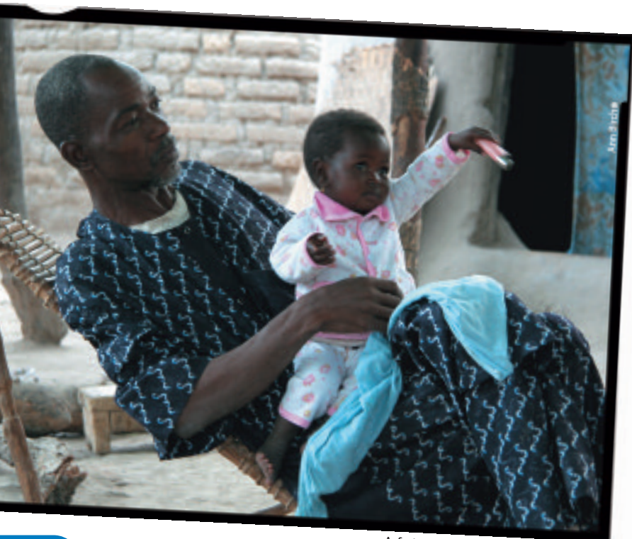
A father agrees to stop excision. Mali

“You are a young and inexperienced person. You think you can tell us what to do? You think you have the right to condemn something that has already been done by our great, great ancestors? Who are you to tell us that we have to stop this practice?” (Group of old men in Mali to a development agent during a public education session on excision)