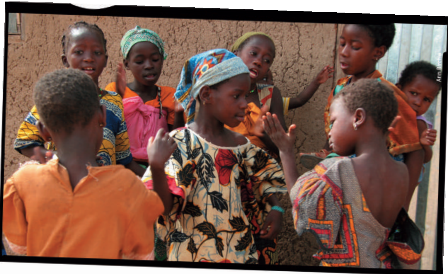
Both excised and non-excised girls play together. Mali

In some communities excision has become a cultural practice that simply “has to be done”. It is reduced to a surgical intervention, there are no preparations or feasts. In other communities excision continues to be part of an initiation ritual that is celebrated extensively.