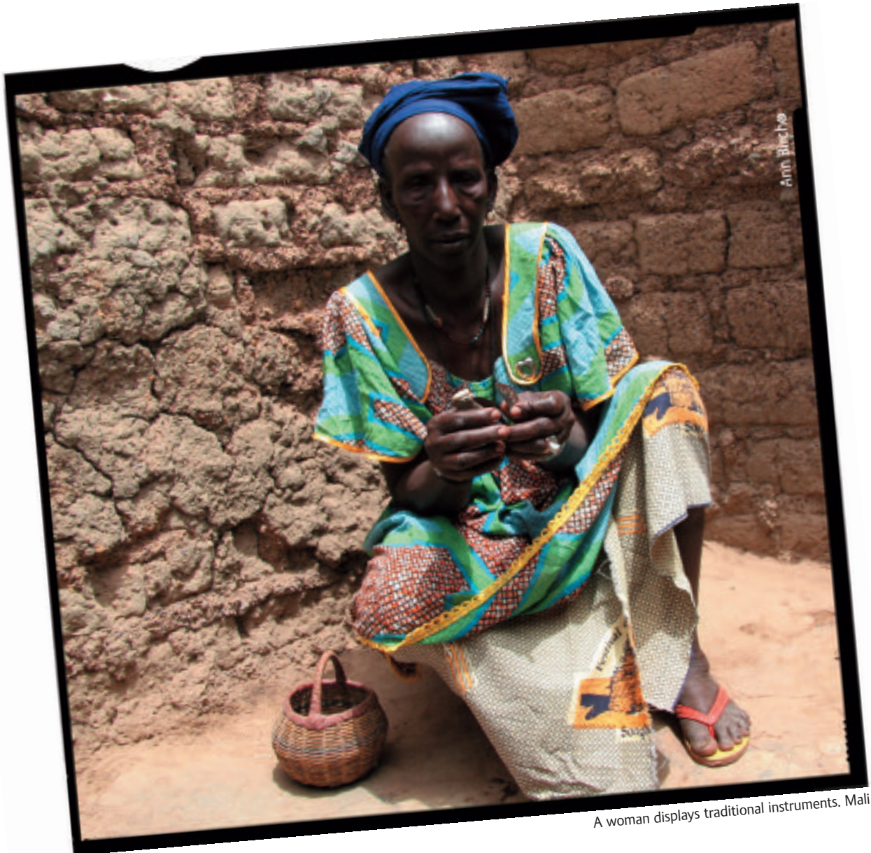
A woman displays traditional instruments. Mali

Although most practitioners are elderly women, this is not always the case. In some societies in Guinea and Sierra Leone girls as young as five years old are trained in the craft, and may start performing excisions before the age of 10. In some ethnic groups in Benin and Ghana, the practice lies in the hands of male fetishists. (18,19)