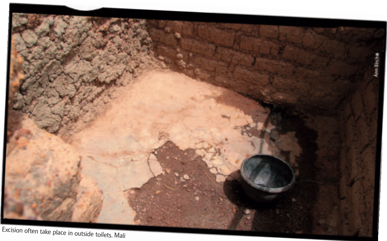
Excision often take place in outside toilets. Mali

In general, the evidence points towards the fact that the risk of serious reproductive health problems is directly related to the degree of invasiveness of the excision. This raises further concerns about the tendency to perform excisions on younger and younger girls in West Africa, because the procedures performed on infant girls tend to be much more invasive than the excisions in adolescents.